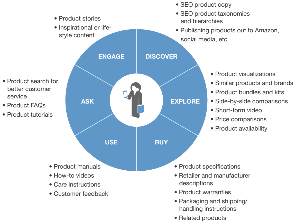
FIGURE 1 The Role Of PIM In A Customer Journey

The 10 Providers That Matter Most And How They Stack Up